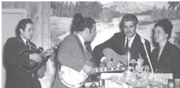
The Sullivan Family often performed at churches throughout the Southeast.