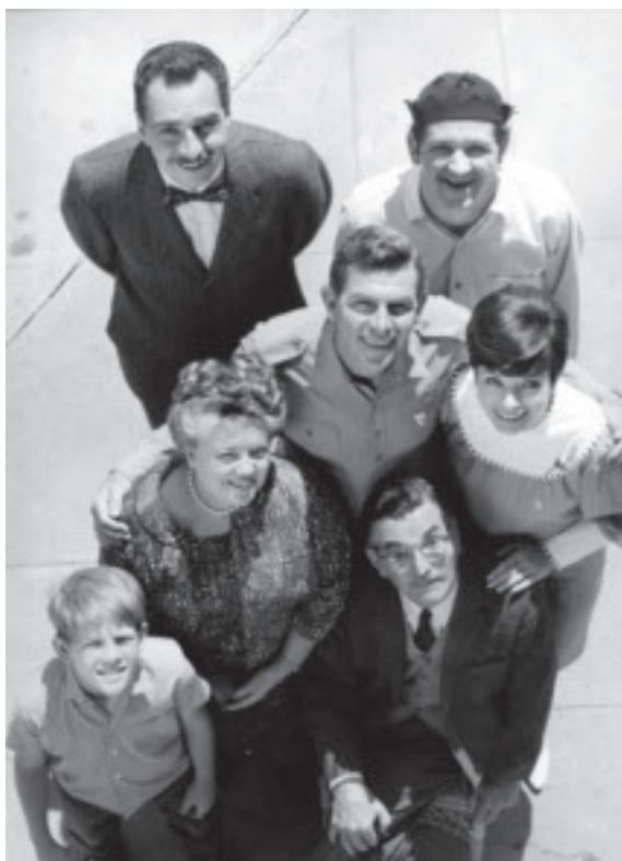
A cast shot of The Andy Griffith Show .