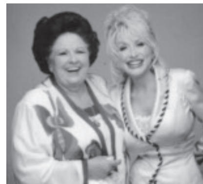
Vestal Goodman and Dolly Parton sharing a moment of laughter and fun.

birth to a series of television and video specials entitled the Gaither Homecoming Series . Vestal and Howard Goodman were a major part of the revival of gospel music that occurred via the series. The series topped the charts of the worldwide music industry. At one point, Billboard Magazine ranked them number one in all genres of music. Thanks to the contributions and popularity of gospel music artists such as Vestal