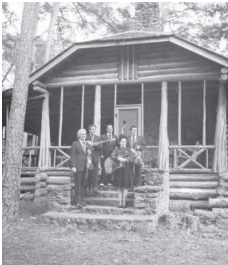
Dressed and ready to perform in an earlier photograph.