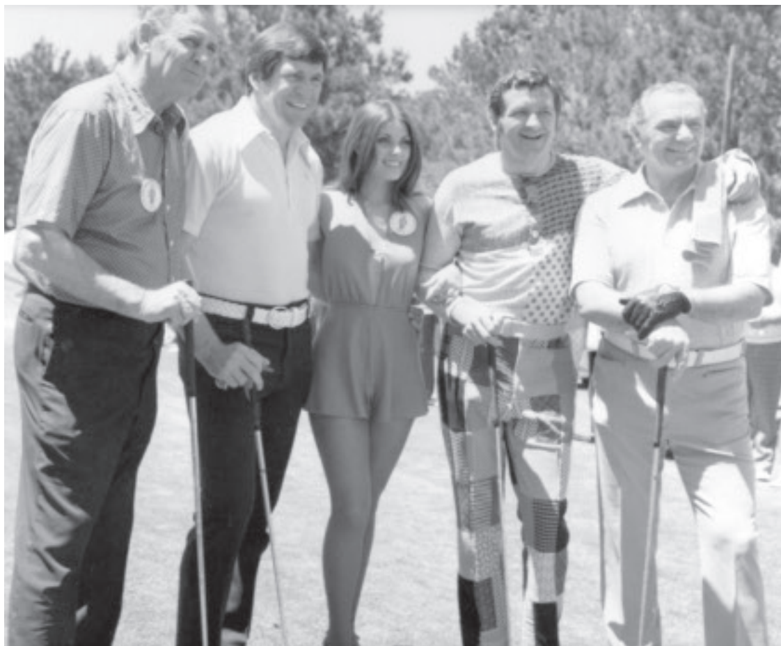
The First George Lindsey Celebrity Golf Tournament held in Montgomery for the Alabama Special Olympics. Pictured left to right, Paul "Bear" Bryant, Leroy Jordan, unidentified woman, George Lindsey and Earnest Borgnine.

The "Jar" television drama was directed by longtime Hitchcock collaborator Norman Lloyd, best remembered for his sinister title role in the legendary director's 1942 thriller Saboteur as well as his more recent performance as Dr. Auschlander on the long-running medical series St. Elsewhere .