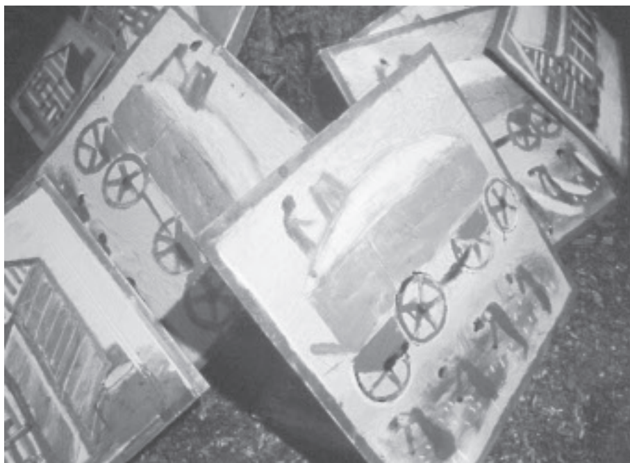
Samples of Sudduth's paintings.