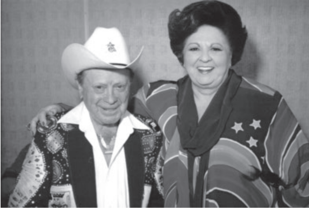
Little Jimmy Dickens and Vestal Goodman backstage at the Grand Ole Opry.

greatest honors to put Sand Mountain and Fyffe, Alabama on the map.